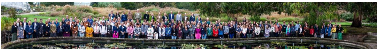
Figure 1. On-site participants of the 2023 State of the World’s Plants and Fungi symposium held at the Royal Botanic Gardens, Kew, in October 2023. The symposium also included online participants and was streamed on social media. Free online access, reduced fees for students and two bursaries for participants from low-income countries contributed to a diverse and international representation of backgrounds, career stages, professional affiliations and individual perspectives.

The 2030 Declaration on Scientific Plant and Fungal Collecting has its foundation in the State of the World’s Plants and Fungi 2023 report (Antonelli et al., 2023), with its associated underlying papers and international symposium. It has arisen from workshops and discussions involving some of the 228 in-person symposium delegates (Fig. 1), including scientists, students, educators, policymakers, and members of non-governmental organisations spread across 31 countries worldwide. While every effort was made to design and implement an inclusive, equitable and open process, we acknowledge inherent geographic biases and power imbalances (see our position statement below). The identification of just over 30 global plant diversity darkspots and areas of high fungal diversity presented in the report and associated papers (Ondo et al., 2023; Niskanen et al., 2023) highlighted areas of the world where digitally available plant and fungal specimen data are most likely to be lacking. Those analyses, set alongside a stark assessment of the threats facing undescribed species (Brown et al., 2023), provided the impetus to galvanise and better coordinate global collecting efforts. The primary aim was to join the botanical and mycological communities in a collaborative endeavour to produce recommendations for accelerating collecting activities, taxonomic work and training to fill important knowledge gaps.