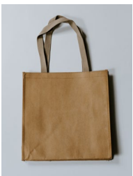
A collecting bag

1 With your child, go for a walk in your local woodland or park.