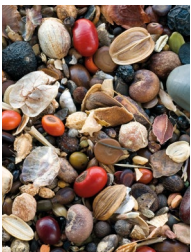
A selection of different seeds