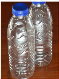
A plastic bottle (recycled)